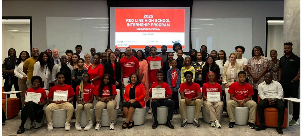
2025 Red Line interns, MTA staff and past program alumni who participated in the program 15+ years ago.

This summer, Red Line interns participated in six powerful weeks of learning, creating, and exploring Baltimore's transit system. The Red Line High School Internship Program included students from Edmondson-Westside, Patterson, and Woodlawn High Schools. Chosen from more than 40 applicants, this year's