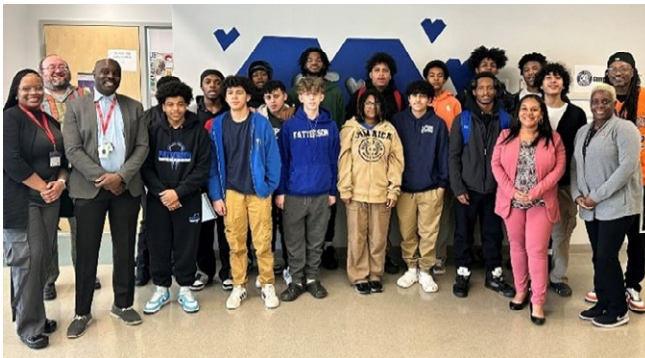
The Red Line team's intern program visit to Patterson High School