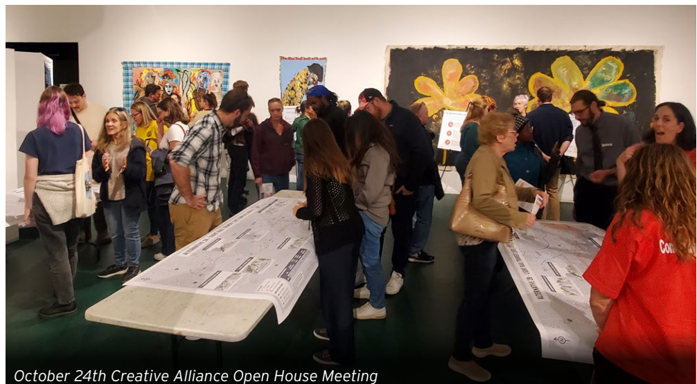
October 24th Creative Alliance Open House Meeting