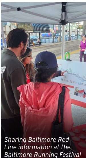
Sharing Baltimore Red Line information at the Baltimore Running Festival